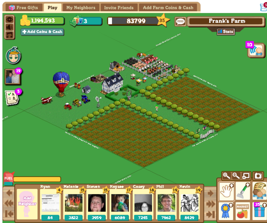
Figure 2: Screen Shot of Student's Farm