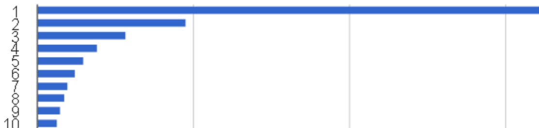
Figure 2. Clicks by position in Summon at UBC

Therefore since most search results in any given search query are likely to be journal articles, it is not surprising that e-books and other types of formats are not as prominent and therefore not used as frequently.