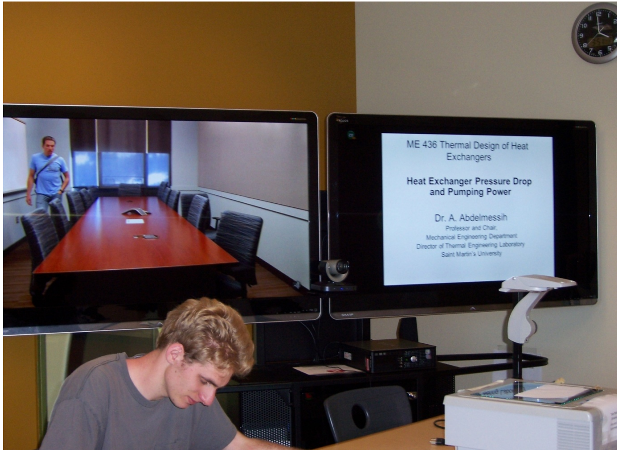
Figure 2: Video Conferencing between Main campus and the extension.

particularly helpful with the final presentations of the projects where students at both locations had a chance to present their projects. Though the compressed images, and the way both classrooms were configured made it difficult to fully critique the presenters, and give them valuable feed back comparable to that given in a face-to-face set classrooms. In face-to-face classroom there is an instructor station, and free space for students to move next to the projection screen or the instructor station, unlike the videoconferencing room where student locations are set by the location of the camera, space is limited and students had to either sit down or bend to reach the computer key. Also the delayed transmission made it difficult to notice body language, and any subtle movements of the presenter.