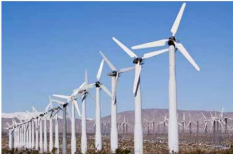
Windmill Tour 9:00-11:00 am

Breakfast tickets will be provided for individuals who would like to have breakfast in the hotel's Terrace Restaurant. Tickets will only be good for Thursday and will not include the tip.