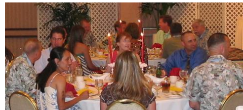
Having fun at the Awards Banquet