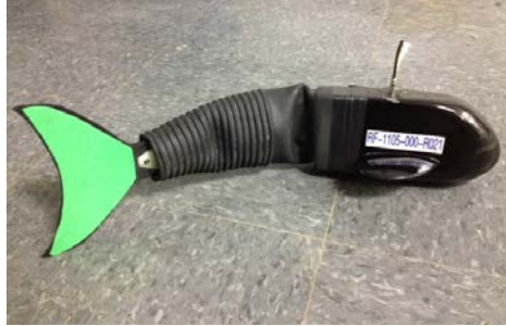
Figure 2: Physical Structure of Robotic fish

The center piece of the platform is the decision making subsystem. Developed by Peking University, the decision making subsystem is centered on a graphical user interface (GUI), which conveniently gathers necessary information, allows the user to choose different robotic fish strategies, and set parameters of the environment (goals, obstacles, etc.) with ease. The software platform is established utilizing Visual C++ Service Pack 5 on Windows environments. The GUI maps the robotic fish strategies to a C-file in the directory, which can then be changed by the user. Figure 3 shows the main window of the GUI.